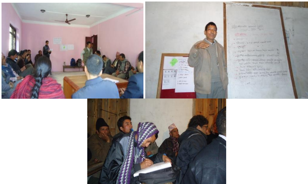
Figure 4 Various Meetings of DIWRMC