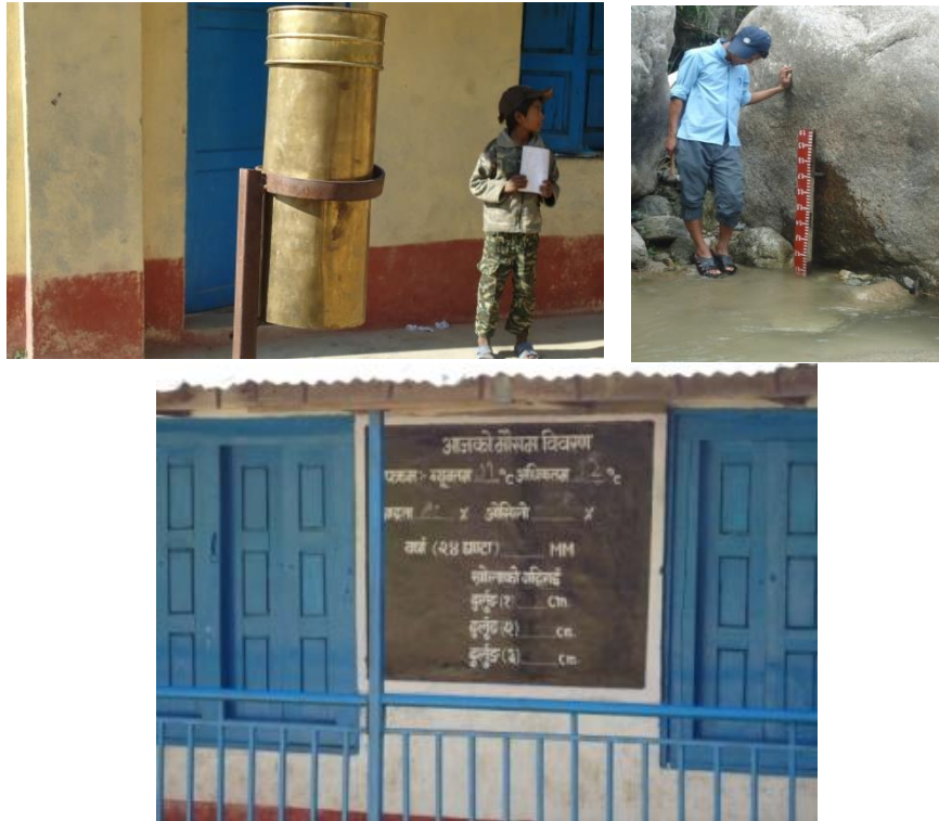
Figure 3 Manual measurement of rain (a) and river (b). Publication on whether board (c)

materials (1 m) and installed in the river. Environmental alert and a teacher supervisor were given training and responsibility to measure rainfall, temperature, humidity in school premises and the reading of water level in the river. They further published daily data in a weather board placed in visible spot of the school. This has given ample opportunities for the students in school to learn and make other people at home to understand daily weather variation. Unless people become aware and capable of understanding and measuring the data from village it is impossible for them to plan for IWRM. If weather and climatic variation is understood by locals they can assimilate themselves in a way to save their crop and possible local disaster.