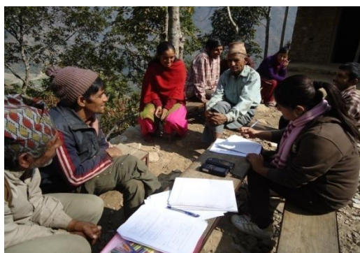
Figure 2 FGD in Jhingedanda cluster of Durlung Basin

45 % of household surveyed from different VDCs, wards and settlements of Durlung watershed in a question to knowing and understanding of climate change term they said they do not know the term. Focus group discussion carried in 7 clusters and individual talk to key informant also revels of not been aware of climate change and climate change effect.