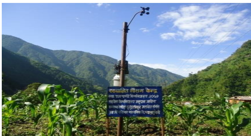
Figure 5 Automatic whether station

DIWRMC also established a DAVIS Vantage Pro2 Automatic Weather Station (AWS) in Sano Durlung, Chamrangbesi VDC which records the weather parameters. As the console with display is placed in the house of local tea shop, it is visible for everyone to refer the daily temperature, relative humidity, solar radiation, wind speed and direction and rainfall. An explanation sheet was attached near the console so that enthusiastic local youth and villager can read the data and talk about the temperature viability not only in hot and cold reference but in degree centigrade. Nowadays this make them more aware of fluctuation weather parameters and equipped them to understand climate change in long run.